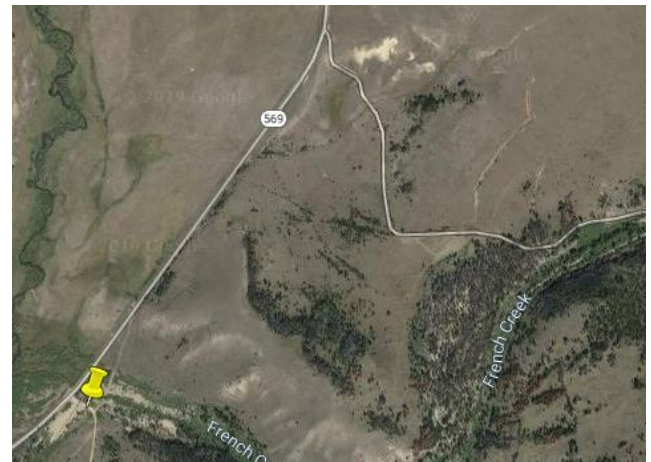
French Gulch parking